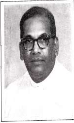
The Rev. Canon Baboo recalls with deep emotion: